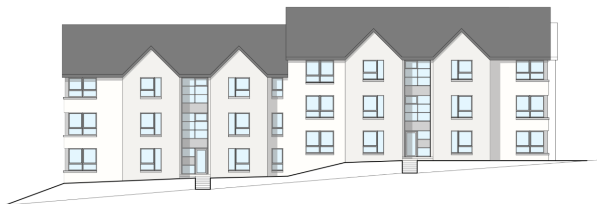
4. BLOCKS FRONT ELEVATION